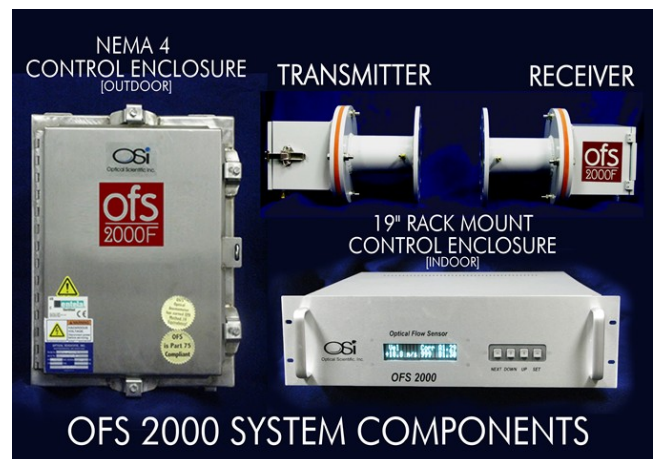
OFS 2000 SYSTEM COMPONENTS

All systems are equipped with 4-20mA Current Loop, RS-232/485, ModBus RTU data outputs, and can be configured with Serial port, Limited Distance Modem, and Fiber Optic Interface for any type of PLC, DAS, WAN or LAN.